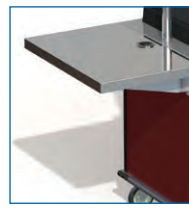
Optional Drop Leaf