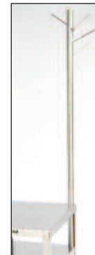
#8560 optional Accessory Storage Pole